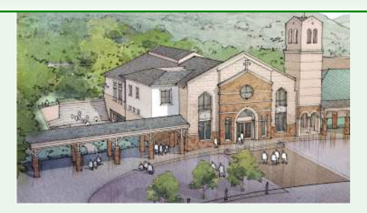
ST. CLARE OF ASSISI, EDWARDS

We've now reached $10 million in gifts/pledges from 224 parishioners!