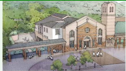
ST. CLARE OF ASSISI, EDWARDS

We've now reached $10 million in gifts/pledges from 224 parishioners!