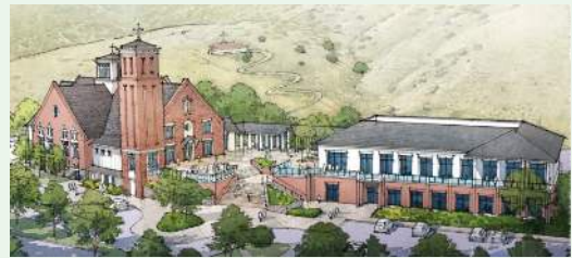
ST. MARY, EAGLE-GYPSUM