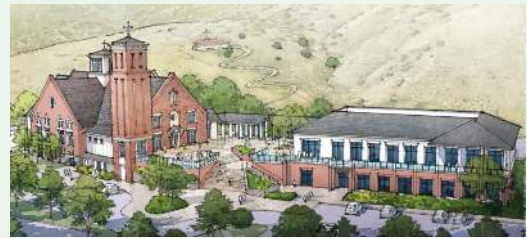
ST. MARY, EAGLE-GYPSUM